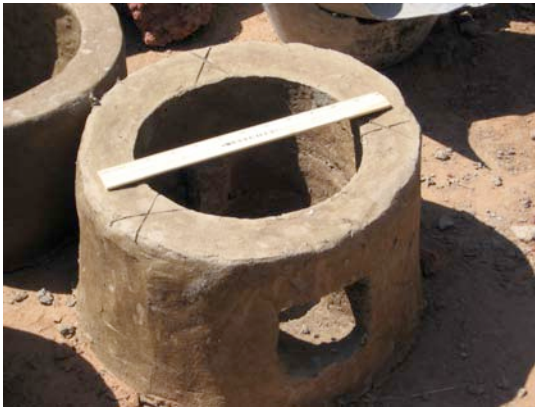
Figure 1: Standard CHF Stove

combustion air flow even when a tight-fitting large pot or a flat metal plate is being used for cooking. In the current ITDG design, either of these would otherwise throttle air exhaust and choke the fire. The newly improved stove, “Avi” was later tested by the ND team, and their impressions are reported in Section 2.2 and 3.3, below.