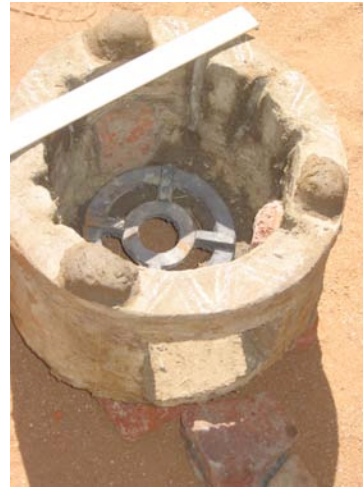
Figure 2: Improved “Avi” Stove

On Sunday Nov. 22, the SD team was invited to give a presentation of its preliminary findings to the UN Office of Coordination of Humanitarian Affairs (UN-OCHA) in Nyala. This presentation and discussion was attended by close to 25 representatives from various NGOs attended at the invitation of UN-OCHA. On November 29-30, the ND team joined the SD team in Nyala. At the markets, the full team explored local capacities in Nyala for producing the most appropriate FES, determined both by the IDPs to be the most suitable for their cooking conditions and by the availability of source materials for making the stove, as well as the logistical and organizational aspects of wide scale rapid stove dissemination in the IDP camps. The SD team left on November 30 for Khartoum.