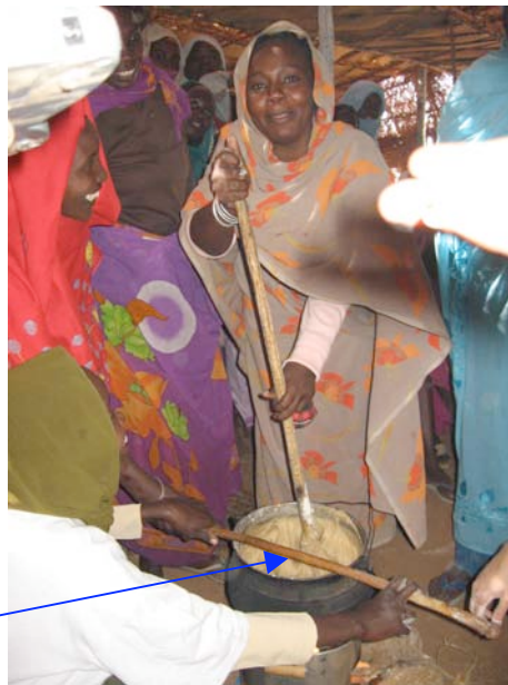
Figure 4: Vigorous stirring on the Tara currently requires too many cooks

Stabilizing the pot with a horizontal stick for stirring of the assida