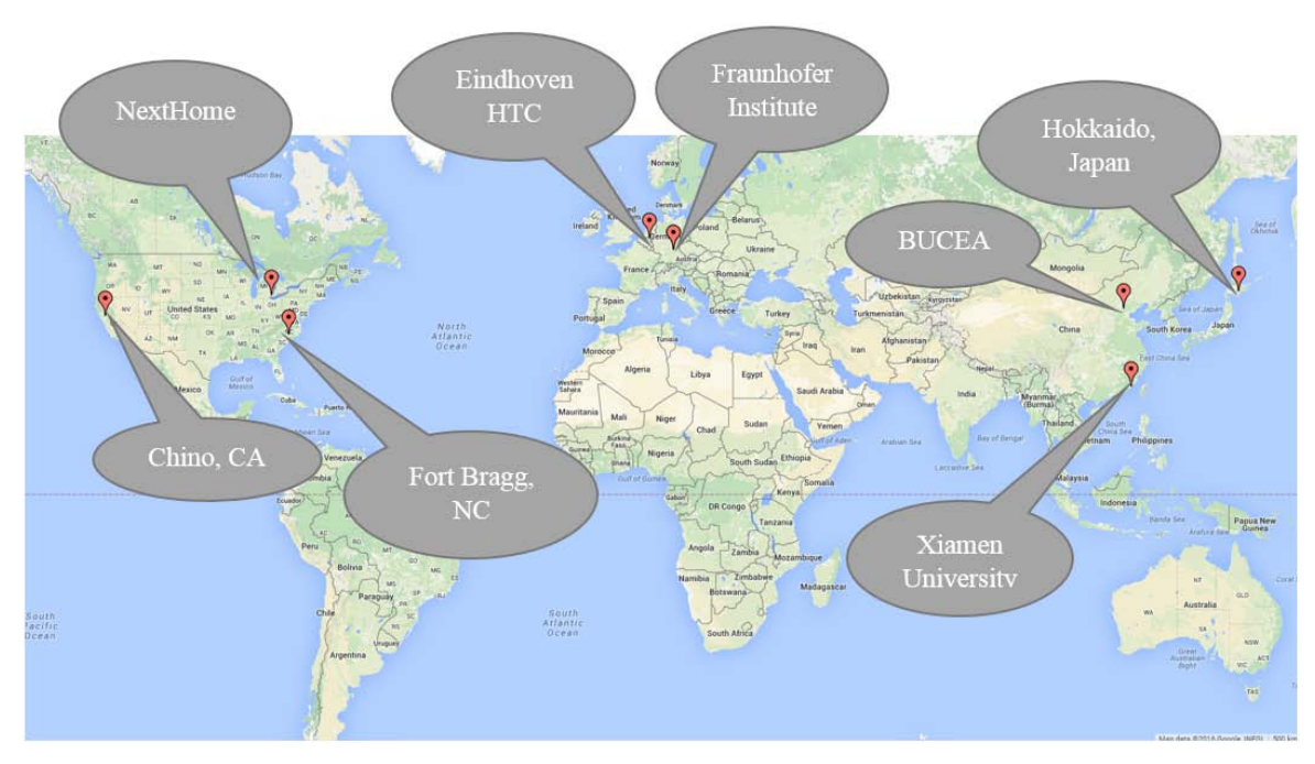
Figure 2. Worldwide Demonstration Sites for DC Distribution in Buildings