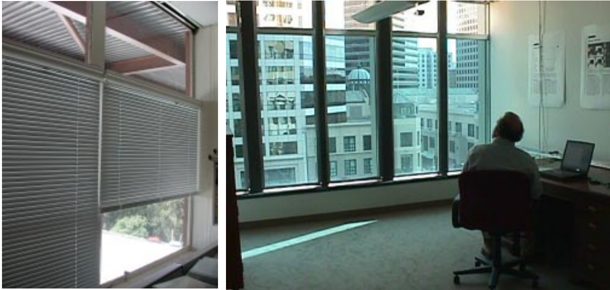
Figure 2. Automated Venetian Blind System based on Dallas Semiconductor 1-Wire® (left) and Large-Area Electrochromic Windows in Oakland Federal Building with Windows in Bleached on Top and Colored State on Bottom (right).

ratory (LBNL) has been involved in various aspects of automated shade design and control. One aspect involves quiet tilt action of an interior Venetian blind. AC- and DC-motors are typically used in shade products offered for both exterior and interior applications. Low-voltage DC motors can provide a more acceptable quality of operation. Software refinements can be made to achieve precise, quiet tilt action of DC-motorized blinds (Lee et al. 1998). To keep costs down, a single transformer is usually dedicated to a group of DC-motorized shades. To reduce costs further, sequential control of shades is cheaper than simultaneous control of an entire bank of shades on a single transformer.