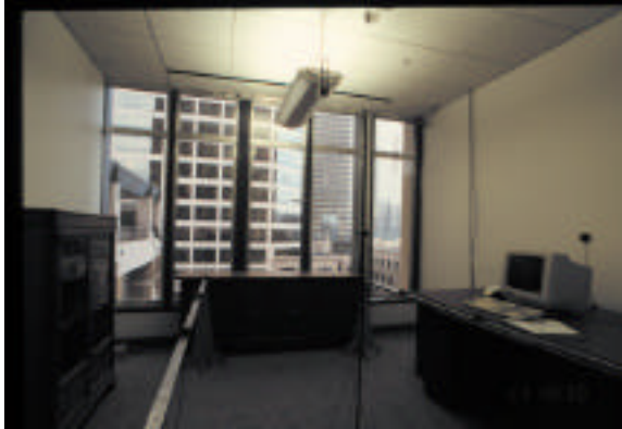
Figure 1. Overcast conditions.