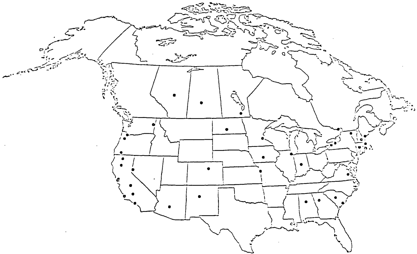
Figure 1: Cities in North America for which the database contains measurements of air leakage.