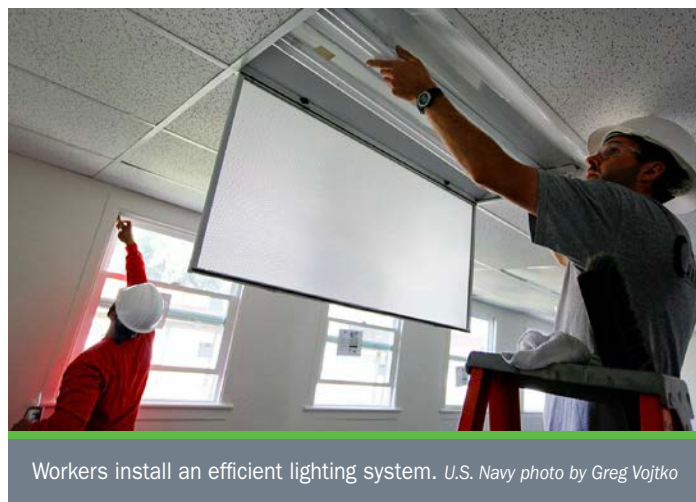
Workers install an efficient lighting system.