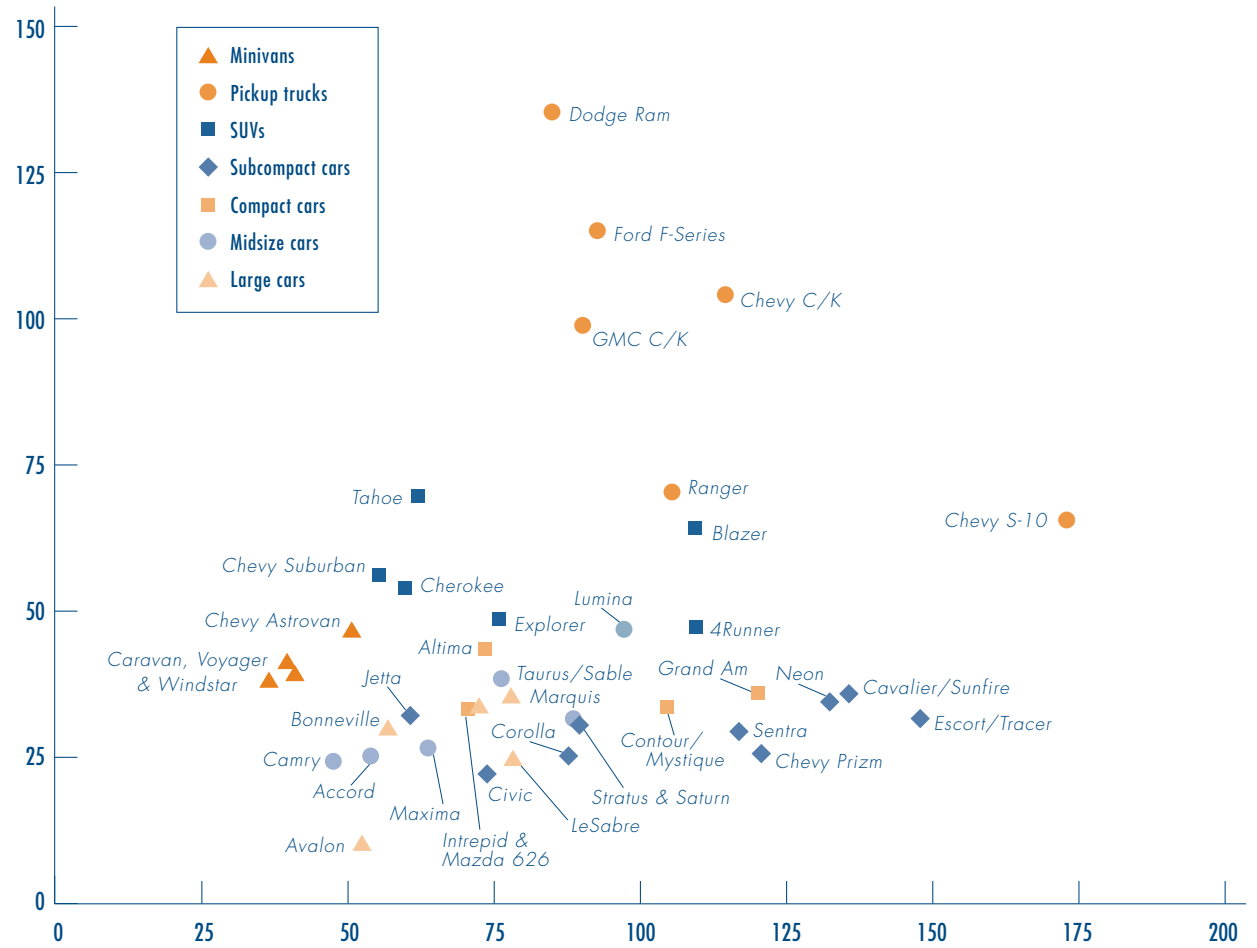
ANNUAL DEATHS OF DRIVERS OF PRIMARY VEHICLES PER MILLION SOLD FROM 1995 TO 1999 FOR MOST MODELS

ANNUAL DEATHS OF DRIVERS OF OTHER VEHICLES PER MILLION PRIMARY VEHICLES SOLD