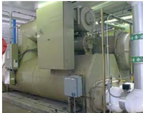
Figure 2. Chiller

Normally, for centrifugal compressor-based chillers, an increase of one degree in the chilled water supply temperature can increase the operational efficiency of the chiller by 1 to 2 percent. If a chiller can supply chilled water at 55°F, it will be approximately 15 to 30 percent more efficient than when it produces chilled water at 40°F (cooler). Based upon energy benchmarking and on-site observation, it is often feasible to implement a chilled water temperature reset to improve chiller performance whenever the system allows.